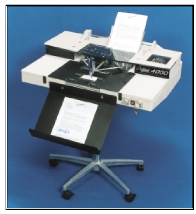
SigTech 4000 pictured with locking casters

Each signature machine requires a signature matrix to reproduce a signature. This signature matrix fits inside the machine and is interchangeable to allow many different individuals to utilize the signature machine. The signature matrix produces a consistent duplication of the signature over and over again. Our signature machines are used by state, local and federal governments, corporations, colleges, prep schools, religious organizations, associations, fundraisers, unions and political groups.